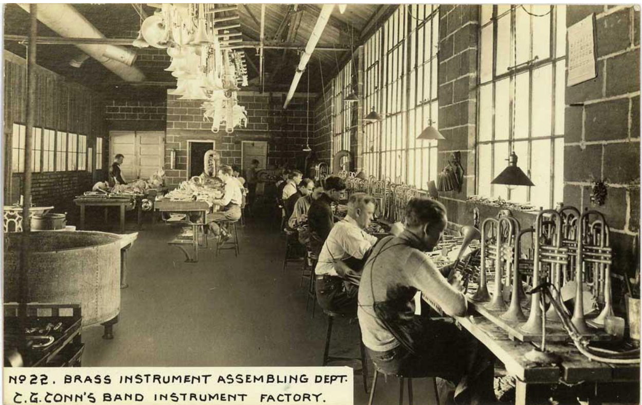
1910's Conn Instruments, Elk Hart, Indiana (NAICS Code 33992)